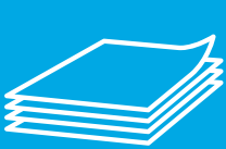
OFFICE PAPER/ FILE FOLDERS