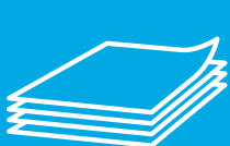
OFFICE PAPER/ FILE FOLDERS