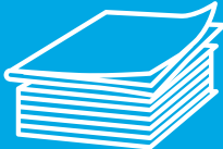
MAGAZINES/ PHONE BOOKS