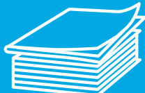
MAGAZINES/ PHONE BOOKS