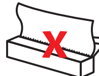
ALUMINUM FOIL, WAX PAPER, PLASTIC FILM