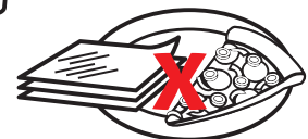
FOOD AND SOILED PAPER