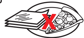
FOOD AND SOILED PAPER